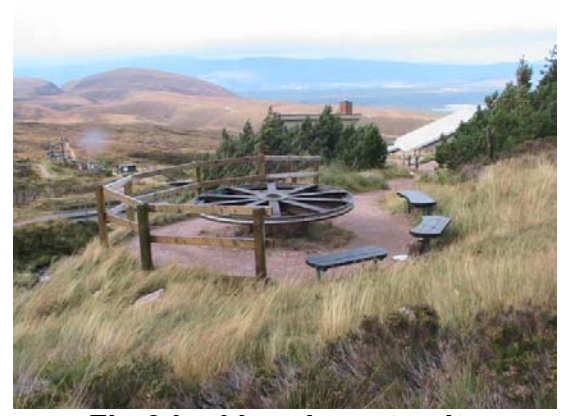
Fig 3 looking down to site