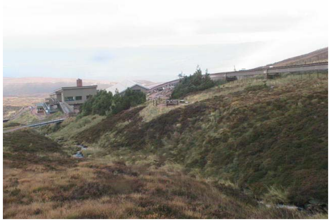
Figure 4 building would be seen end on between the two tree groups.