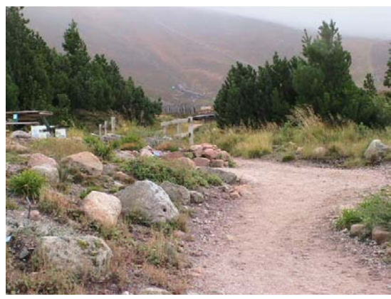
Fig 2 view of site (centre of photo)

1. Full planning permission is being sought for the construction of a camera obscura within a tunnel/dark chamber to form an additional tourist facility within the Cairngorm mountain garden area above the Coire Cas car park and Day Lodge.